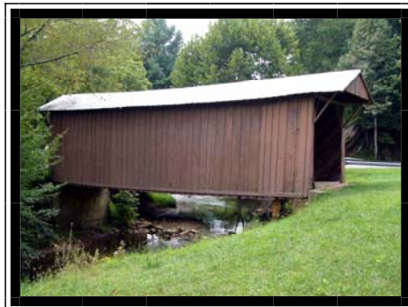
Jacks Creek Covered Bridge

All vendors requiring 220 volt hookup must bring generator.